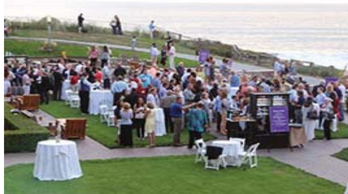
TSLA